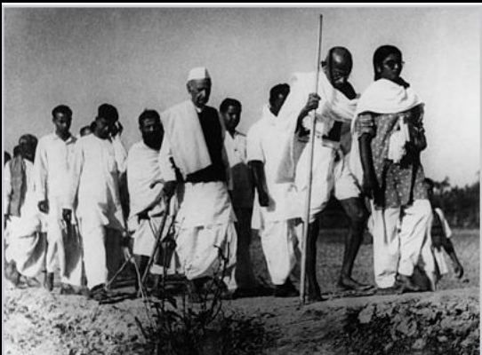
Gandhi in Noakhali, 1946